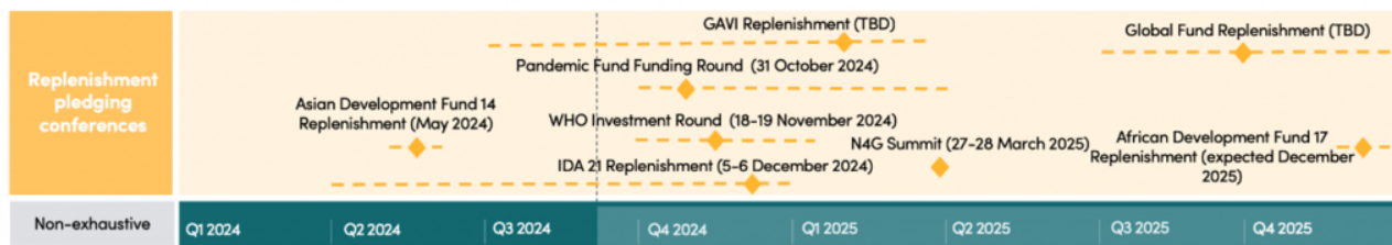
Figure 2: Replenishment Traffic Jam