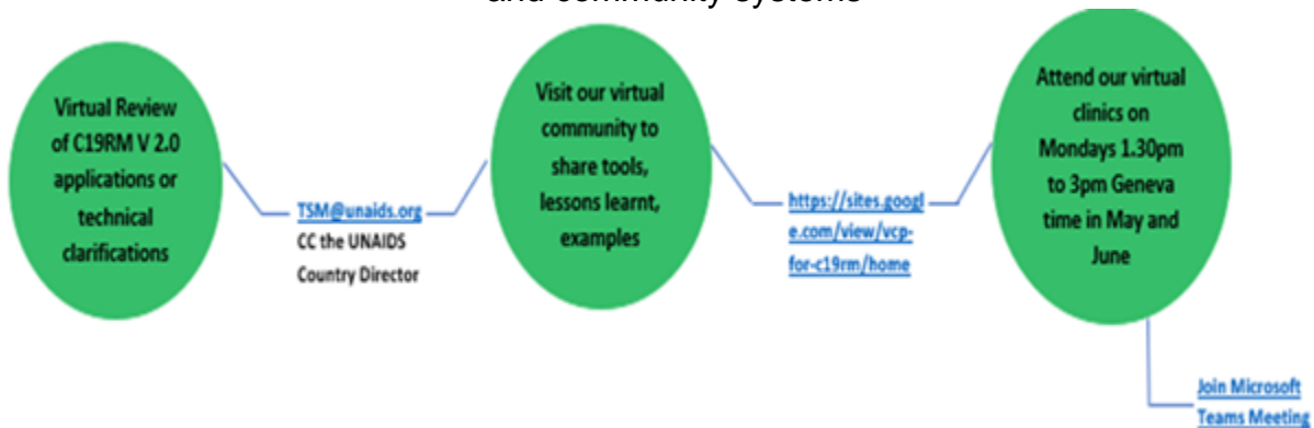
Figure 1. Virtual Help Desk for C19RM V 2.0 funding requests with special focus on HIV impact mitigation and community systems

It comprises three components: (i) remote peer reviews of funding applications and technical clarifications (helpdesk); (ii) establishing a Community of Practice; and (iii) holding Virtual Clinics on topics relevant to C19RM proposal development. The Virtual Community of Practice is shown in Figure 2 below; each hexagon around the Community illustrates one of the many components of the application for which TA can be provided.